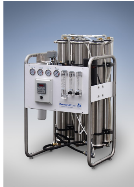
DemandPure™ RO System (shown: 400R)