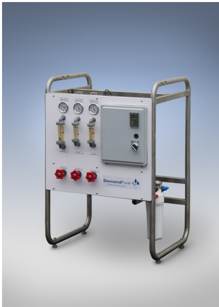
DemandPure™ EDI System (shown: 400E)